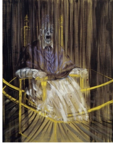
Francis Bacon, Study After Velázquez's Portrait of Pope Innocent X, 1953, oil on canvas