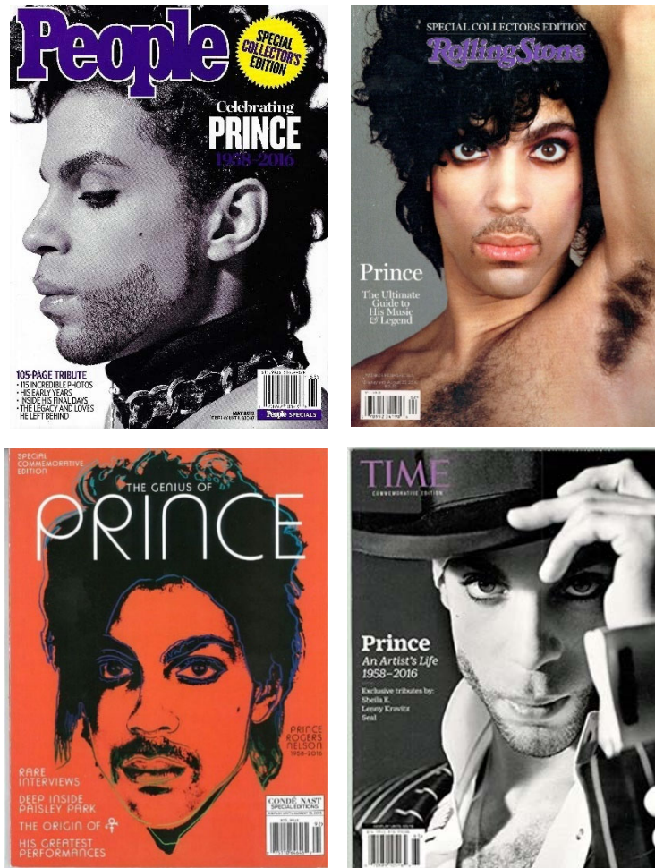
Figure 5. Four special edition magazines commemorating Prince after he died in 2016.

When Goldsmith saw Orange Prince on the cover of Condé Nast's special edition magazine, she recognized her work. "It's the photograph," she later testified. 1 App. 290. Orange Prince crops, flattens, traces, and colors the photo but otherwise does not alter it. See fig. 6, infra .