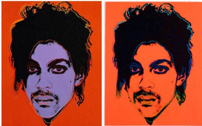
Andy Warhol, Prince, 1984, synthetic paint and silkscreen ink on canvas

174. And as before, Warhol converted the cropped photo into a higher-contrast image, incorporated into a silkscreen. That image isolated and exaggerated the darkest details of Prince's head; it also reduced his "natural, angled position," presenting him in a more face-forward way. Id. , at 223. Warhol traced, painted, and inked, as earlier described. See supra , at 5–6. He also made a second silkscreen, based on his tracings; the ink he passed through that screen left differently colored, out-of-kilter lines around Prince's face and hair (a bit hard to see in the reproduction below—more pronounced in the original). Altogether, Warhol made 14 prints and two drawings—the Prince series—in a range of unnatural, lurid hues. See Appendix, ante , at 39. Vanity Fair chose the Purple Prince to accompany an article on the musician. Thirty-two years later, just after Prince died, Condé Nast paid Warhol (now actually his foundation, see supra , at 1, n. 1) to use the Orange Prince on the cover of a special commemorative magazine. A picture (or two), as the saying goes, is worth a thousand words, so here is what those magazines published: