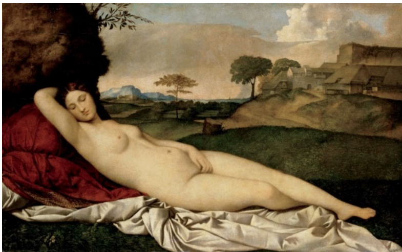
Giorgione, Sleeping Venus , c. 1510, oil on canvas

Consider as one example the reclining nude. Probably the first such figure in Renaissance art was Giorgione’s Sleeping Venus . (Note, though, in keeping with the “nothing comes from nothing” theme, that Giorgione apparently modeled his canvas on a woodcut illustration by Francesco Colonna.) Here is Giorgione’s painting: