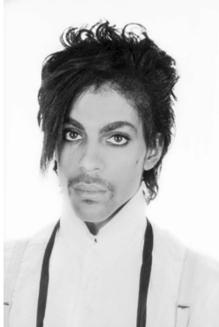
Figure 1. A black and white portrait photograph of Prince taken in 1981 by Lynn Goldsmith.

created a silkscreen portrait of Prince, which appeared alongside an article about Prince in the November 1984 issue of Vanity Fair . See fig. 2, infra . The article, titled “Purple Fame,” is primarily about the “sexual style” of the new celebrity and his music. Vanity Fair , Nov. 1984, p. 66. Goldsmith received her $400 fee, and Vanity Fair credited her for the “source photograph.” 2 App. 323, 325–326. Warhol received an unspecified amount.