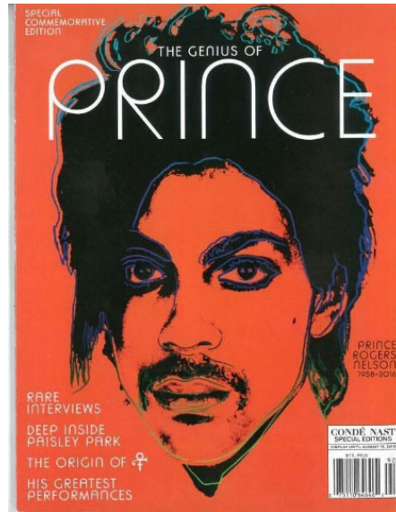
Figure 3. An orange silkscreen portrait of Prince on the cover of a special edition magazine published in 2016 by Condé Nast.

Prince instead. The magazine, titled “The Genius of Prince,” is a tribute to “Prince Rogers Nelson, 1958–2016.” It is “devoted to Prince.” 2 App. 352. Condé Nast paid AWF $10,000 for the license. Goldsmith received neither a fee nor a source credit.