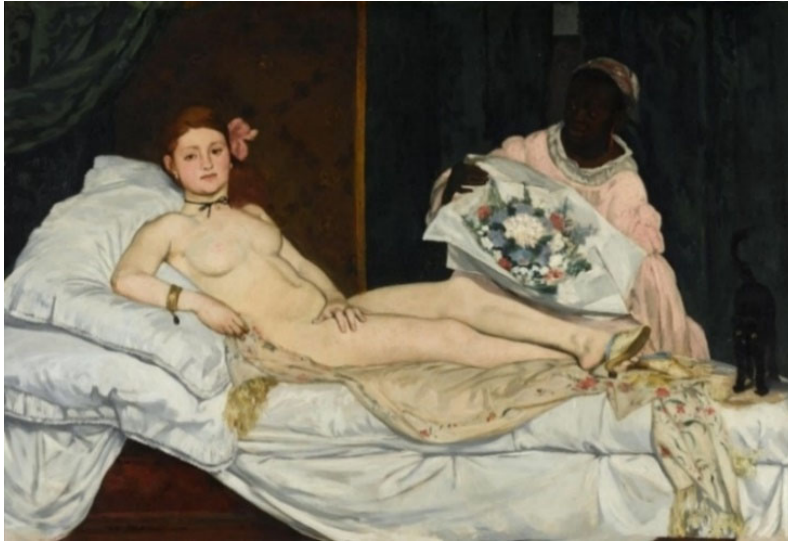
Manet, Olympia, 1863, oil on canvas

Here again consider the account of the Rauschenberg, Lichtenstein, and Mitchell Foundations: “The revolutionary shock of the painting depends on how traditional imagery remains the painting’s recognizable foundation, even as that imagery is transformed and wrenched into the present.” Brief as Amici Curiae 9. It is an especially striking example of a recurrent phenomenon—of how the development of visual art works across time and place, constantly building on what came earlier. In fact, the Manet has itself spawned further transformative paintings, from Cézanne to a raft of contemporary artists across the globe. See id. , at 10–11. But the majority, as to these matters, is uninterested and unconcerned.