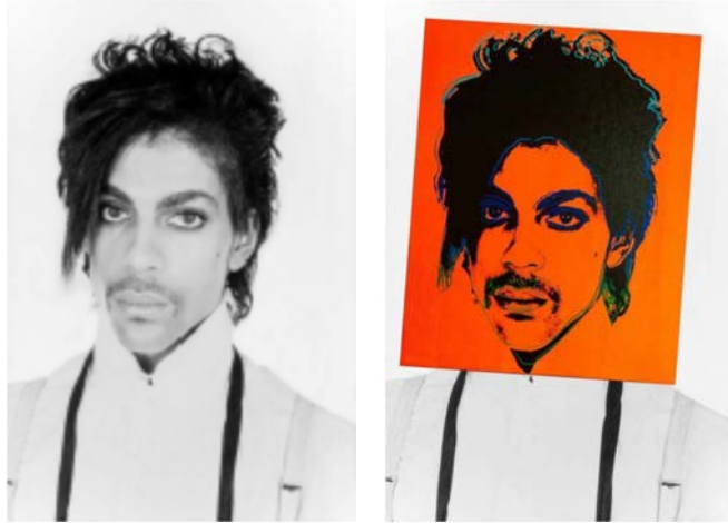
Figure 6. Warhol’s orange silkscreen portrait of Prince superimposed on Goldsmith’s portrait photograph.

Goldsmith notified AWF of her belief that it had infringed her copyright. AWF then sued Goldsmith and her agency for a declaratory judgment of noninfringement or, in the alternative, fair use. Goldsmith counterclaimed for infringement.