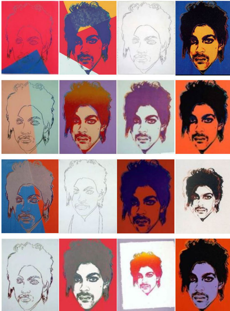
Andy Warhol created 16 works based on Lynn Goldsmith's photograph: 14 silkscreen prints and two pencil drawings. The works are collectively known as the Prince Series.