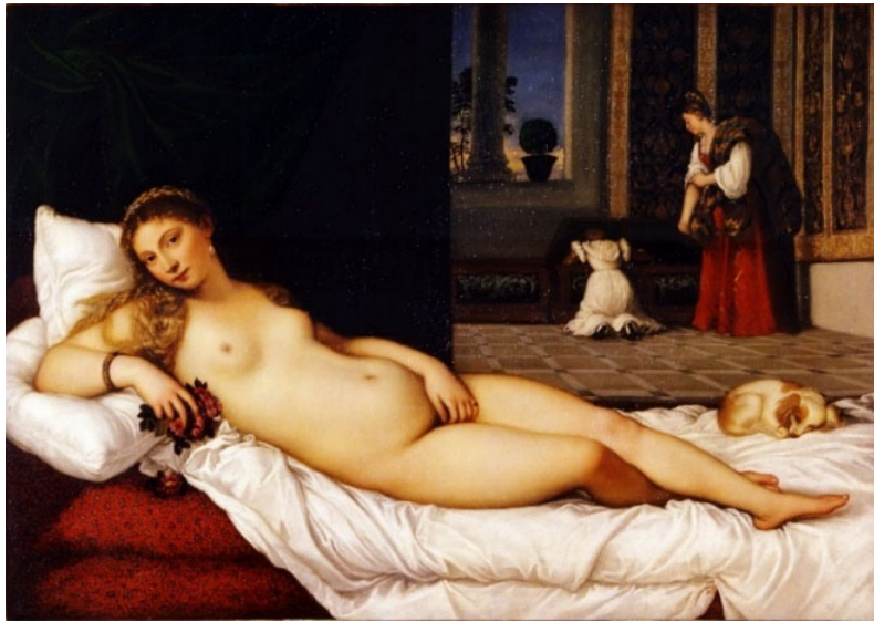
Titian, Venus of Urbino , 1538, oil on canvas

But things were destined not to end there. One of Giorgione's pupils was Titian, and the former student undertook to riff on his master. The resulting Venus of Urbino is a prototypical example of Renaissance imitatio —the creation of an original work from an existing model. See id. , at 8; 1 G. Vasari, Lives of the Artists 31, 444 (G. Bull transl. 1965). You can see the resemblance—but also the difference: