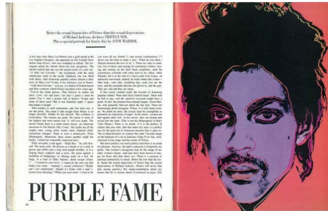
Figure 2. A purple silkscreen portrait of Prince created in 1984 by Andy Warhol to illustrate an article in Vanity Fair.

pencil drawings. The works are collectively referred to as the “Prince Series.” See Appendix, infra . Goldsmith did not know about the Prince Series until 2016, when she saw the image of an orange silkscreen portrait of Prince (“Orange Prince”) on the cover of a magazine published by Vanity Fair’s parent company, Condé Nast. See fig. 3, infra .