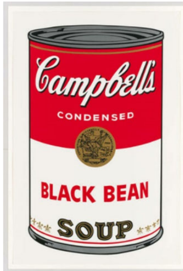
Figure 7. A print based on the Campbell's soup can, one of Warhol's works that replicates a copyrighted advertising logo.

Yet not all of Warhol's works, nor all uses of them, give rise to the same fair use analysis. In fact, Soup Cans well illustrates the distinction drawn here. The purpose of Campbell's logo is to advertise soup. Warhol's canvases do