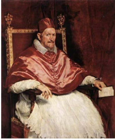
Velázquez, Pope Innocent X, c. 1650, oil on canvas